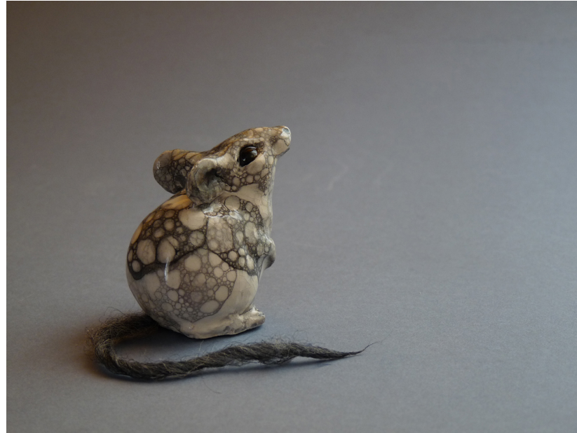
Mouseweb, Michelle Hall, England, 2010