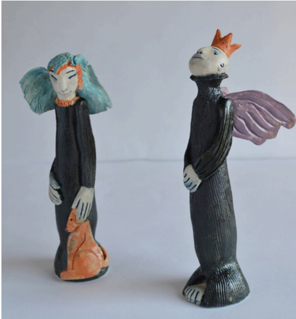
Group 5. Marina Bauguil, England, 2012