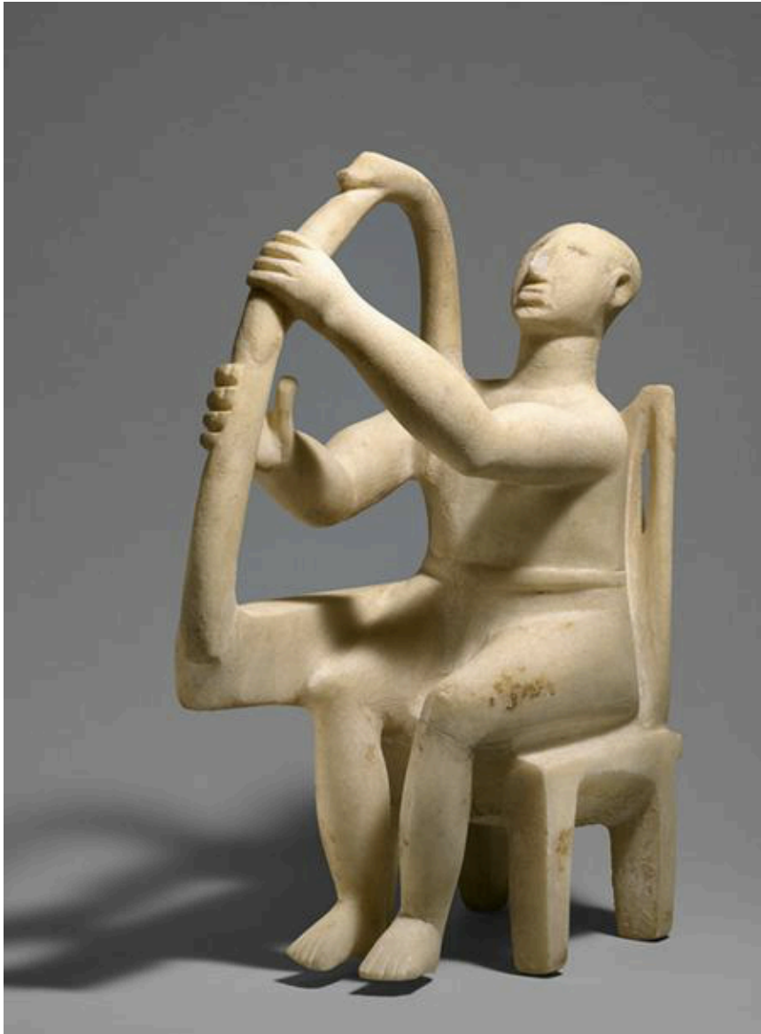
Statuette of Seated Harp Player. (ca 2800-2700 BC). Cycladic Culture. Marble. 29.21cm