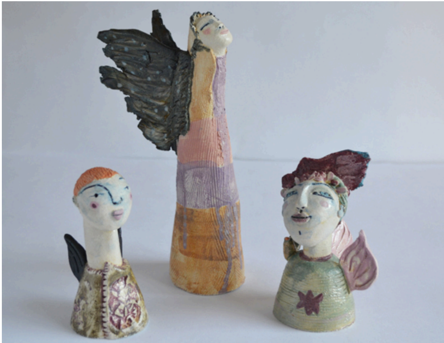
Group 1 Marina Bauguil, England, 2012