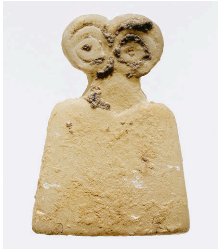
Eye idols of Tell Brak. (3500–3100 B.C.). Syria. Alabaster